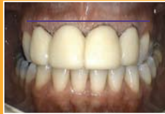
Image 2. The gumline has been made more even with no bleeding or scarring