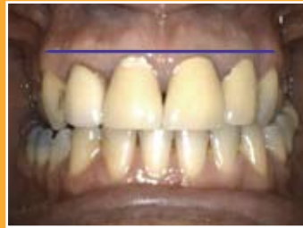
Image 1. Gum lengthening is needed to achieve the best result

With Waterlase MD Dentistry, I was able to remove the gum to the desired level, using a surgical guide showing what we wanted the final crowns to look